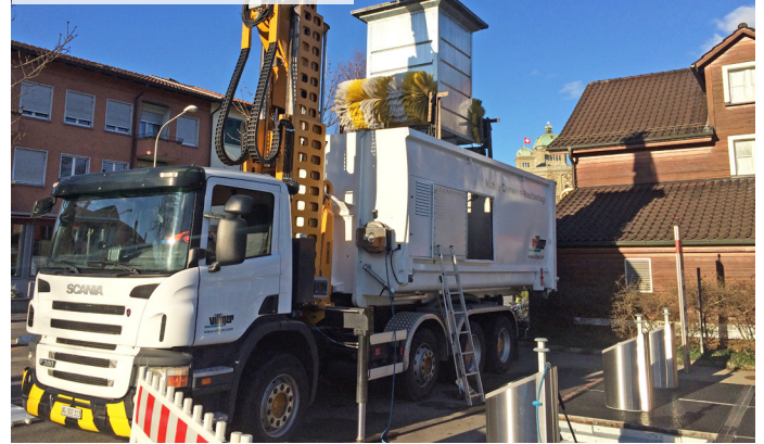
Cleaning of an underground container