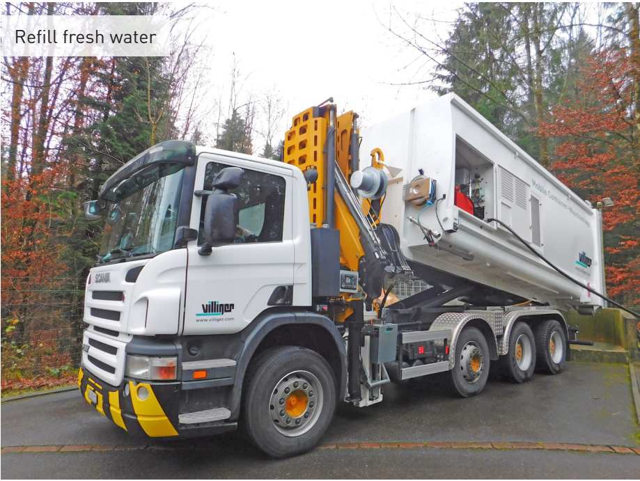
Refill fresh water