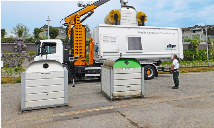
Cleaning of an above ground container